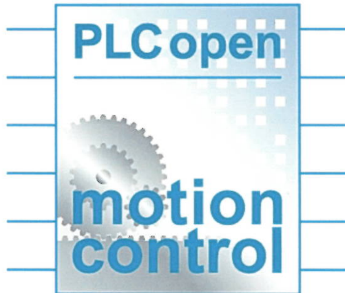
Figure 1: The PLCopen Motion Control Logo

For quick identification of compliant products, PLCopen has developed a logo for the motion control Function Blocks: