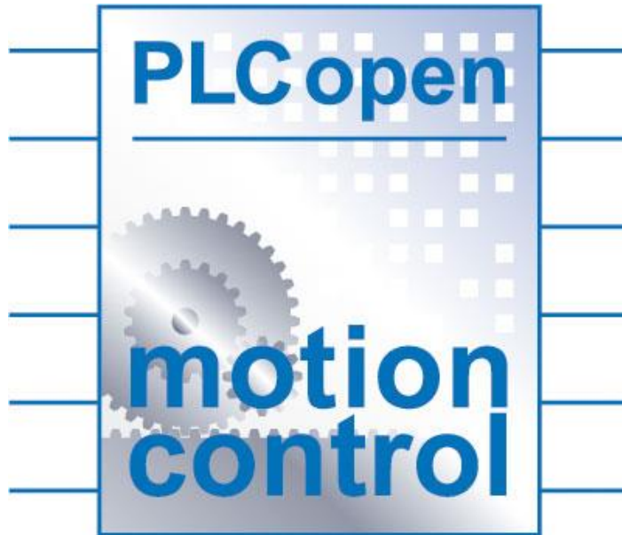
Figure 1: The PLCopen Motion Control Logo

For quick identification of compliant products, PLCopen has developed a logo for the motion control Function Blocks: