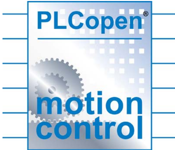
Figure 1: The PLCopen Motion Control Logo

For quick identification of compliant products, PLCopen has developed a logo for the Motion Control Function Blocks: